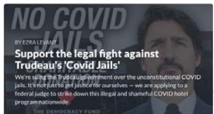
Figure 1. Example of Rebel News story